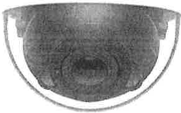
Honeywell • 24 Series