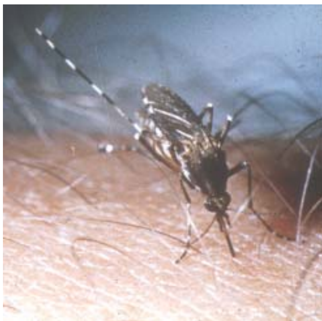
Female mosquito feeding

The virus becomes widespread in the wild bird population by midsummer, when mosquitoes are abundant. The likelihood that mosquitoes will become infected and transmit the virus to dead-end hosts such as people and horses is highest between July and late October. A few Culex species are the probable vectors of West Nile virus. Aedes albopictus (Asian tiger mosquito) is also of concern.